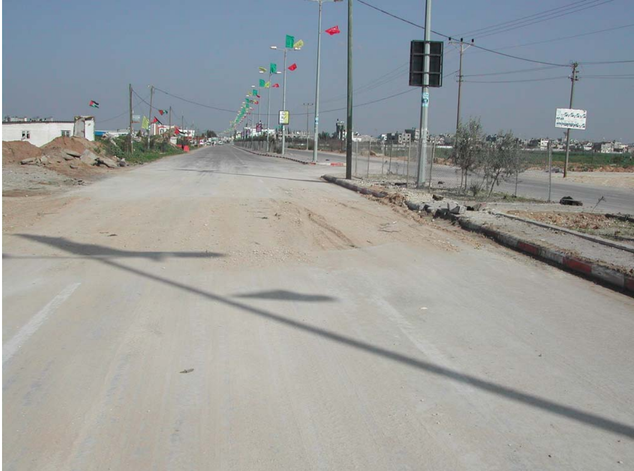
View to Beit Hanoun Big hole in the road- the hole had been filled up by kurkar