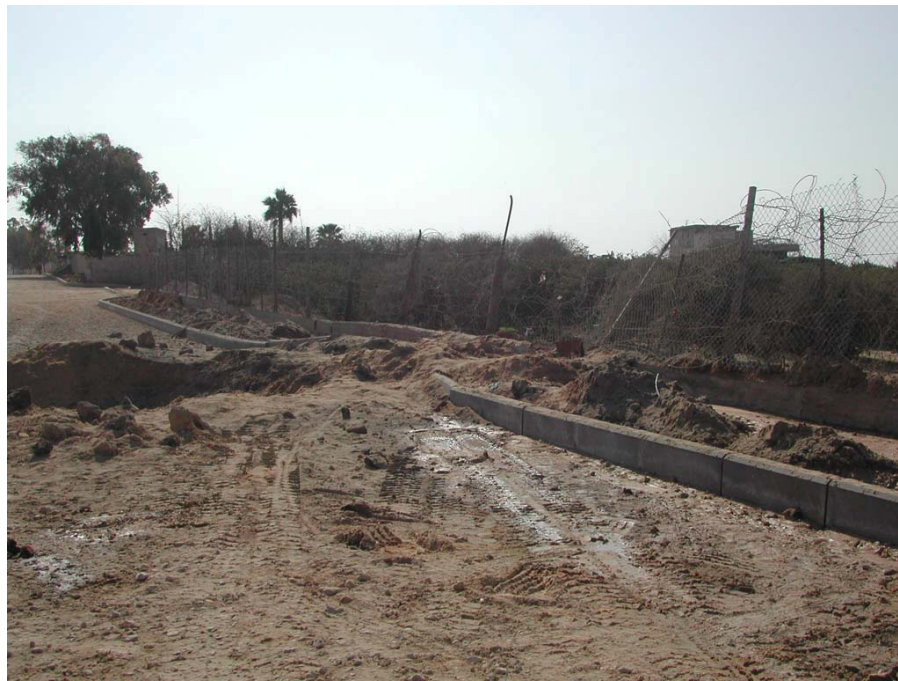
Big hole in the road, damages to curbstone, base course and water pipes (Main line)