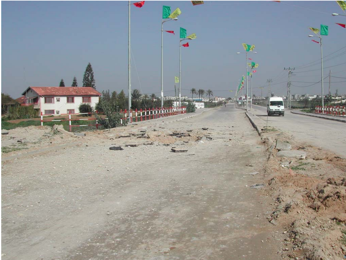
View towards Beit Hanoun Two deep holes, damages in the western wing (concrete wall)