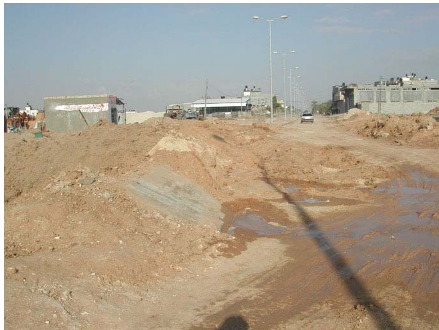
El Seka Bridge - Water line and sewage line had been damaged.