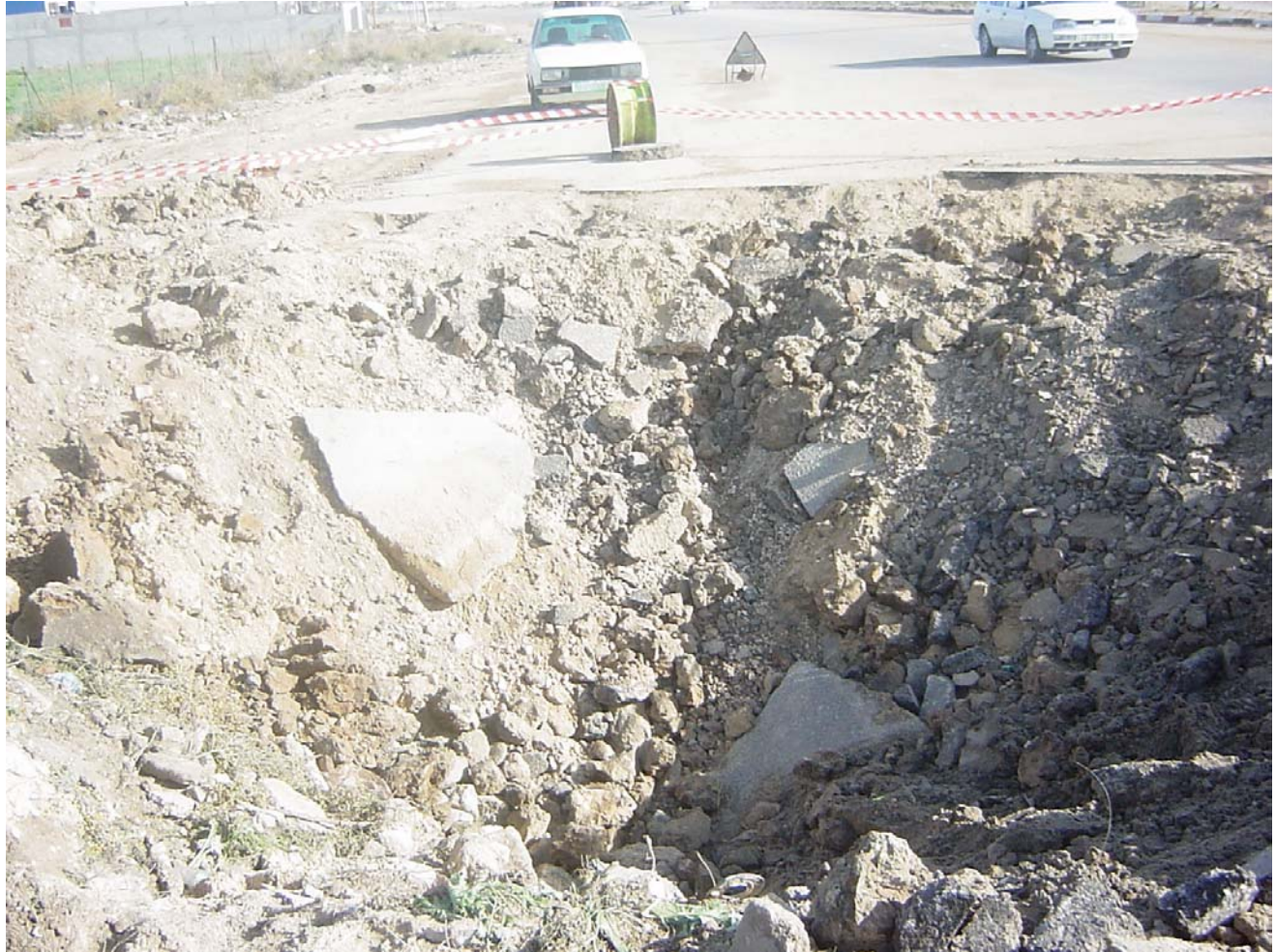
Salah Din Street Detail