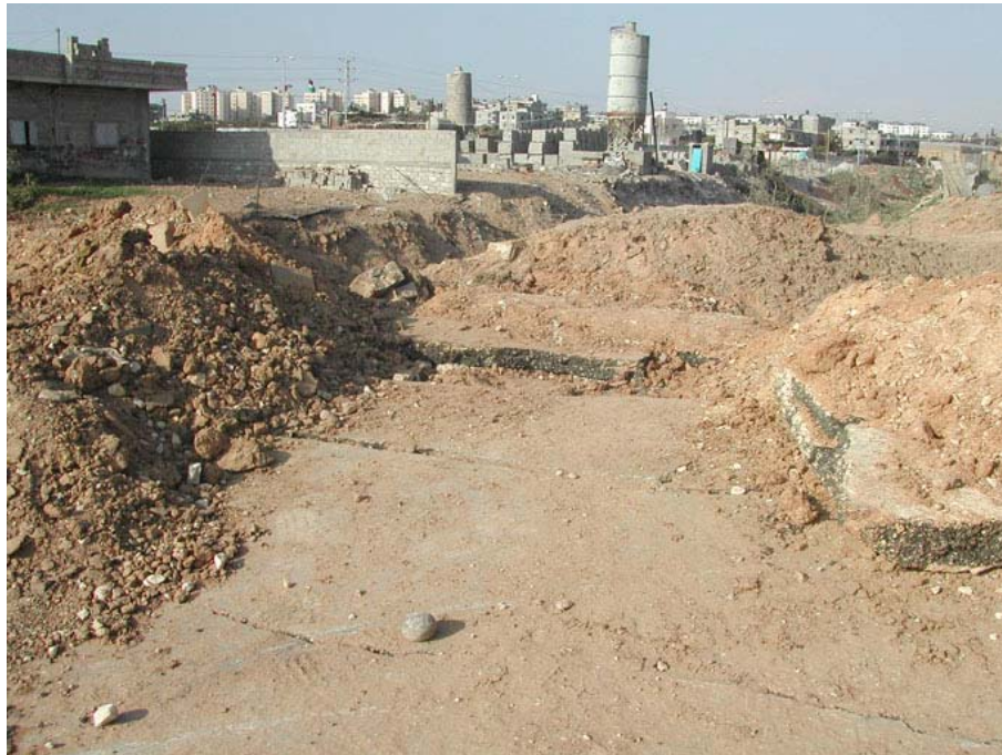
El Seka Bridge - The damaged area around the bridge