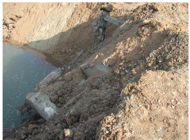
El Seka Bridge Details