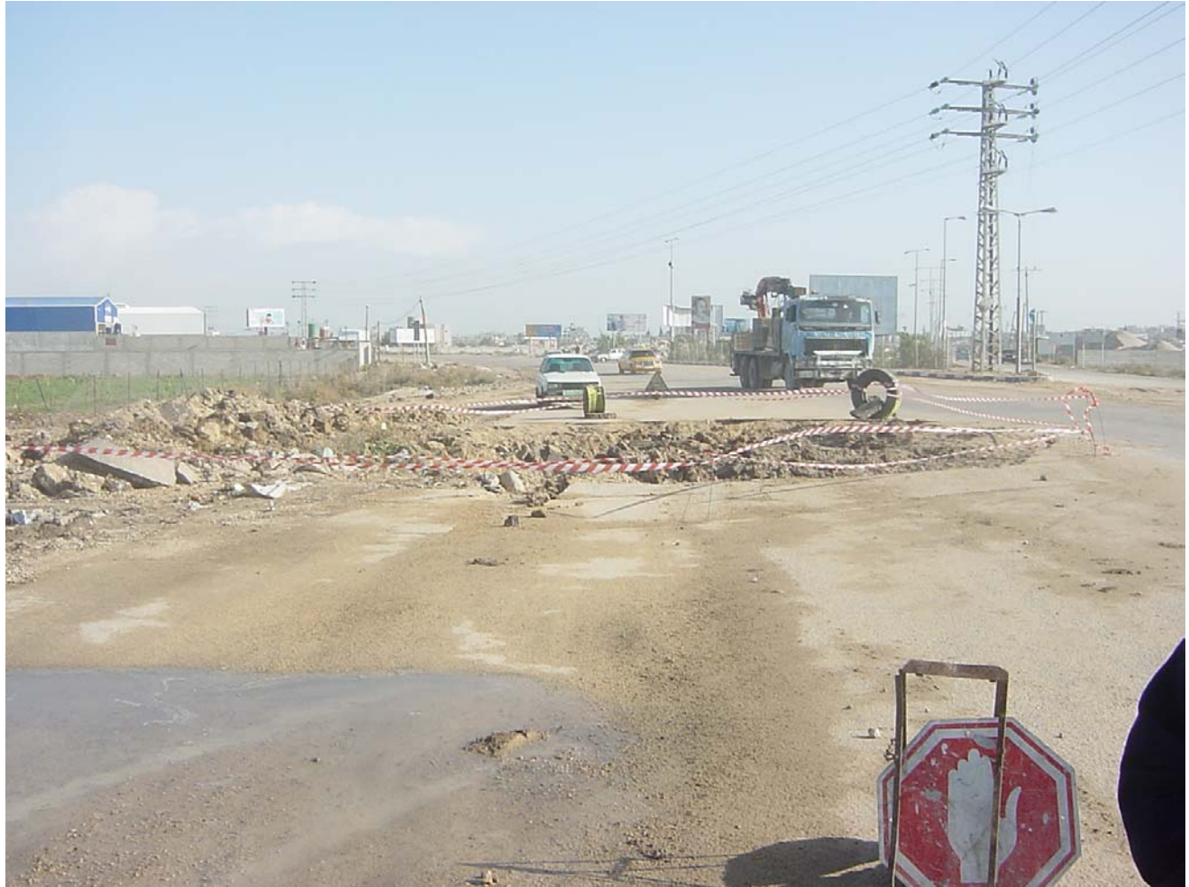
Salah el Din Street