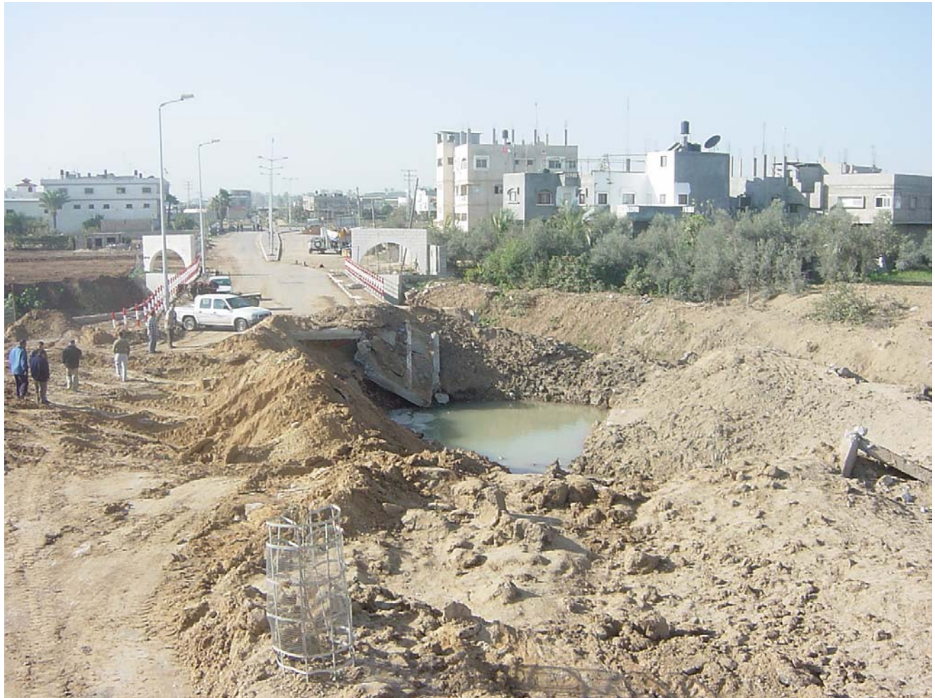
The El Seka Bridge was funded by USAID. View to the South