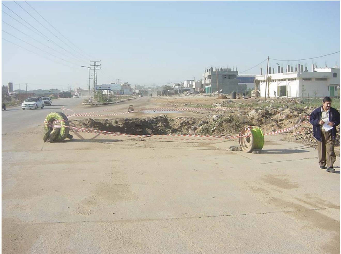
Salah El Din Street - Beit Hanoun Entrance View towards Gaza City