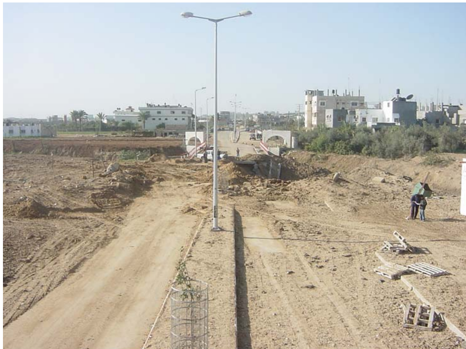
El Seka Bridge - General view of the damaged part of the bridge