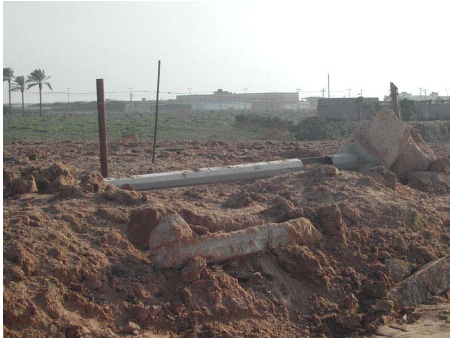
El Seka Bridge – Destroyed electrical pole and manhole