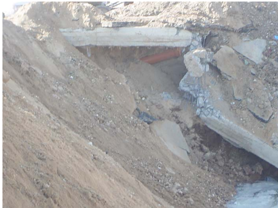
El Seka Bridge - Damaged pipes