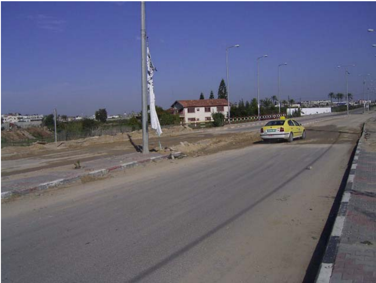
View towards Beit Hanoun.

The IAF attack the 14-15 December produced as a result two big holes in the road just south of the bridge. The holes have been filled up with kurkar material in order to make the road accessible for vehicles to pass in and out of Beit Hanoun.