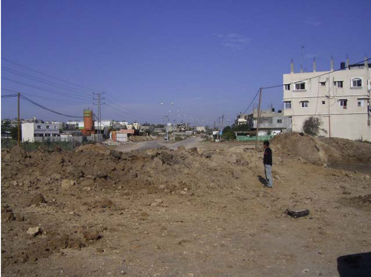
View of Saleh El Din Road in the direction of Erez – northwest of El Seka Bridge (located to the right but out of the picture). The damaged area is of approximately 20m x 20m with a 5m deep hole.