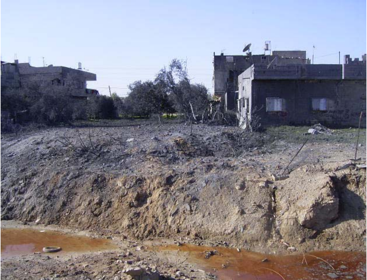
Evacuated houses to the west of the El Seka Bridge